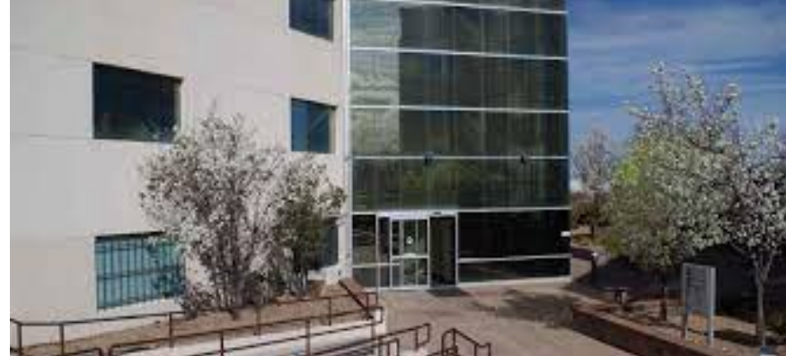
{\bf Med\ Fragile\ Nurse\ Case\ Management\ Program\ building-Now}